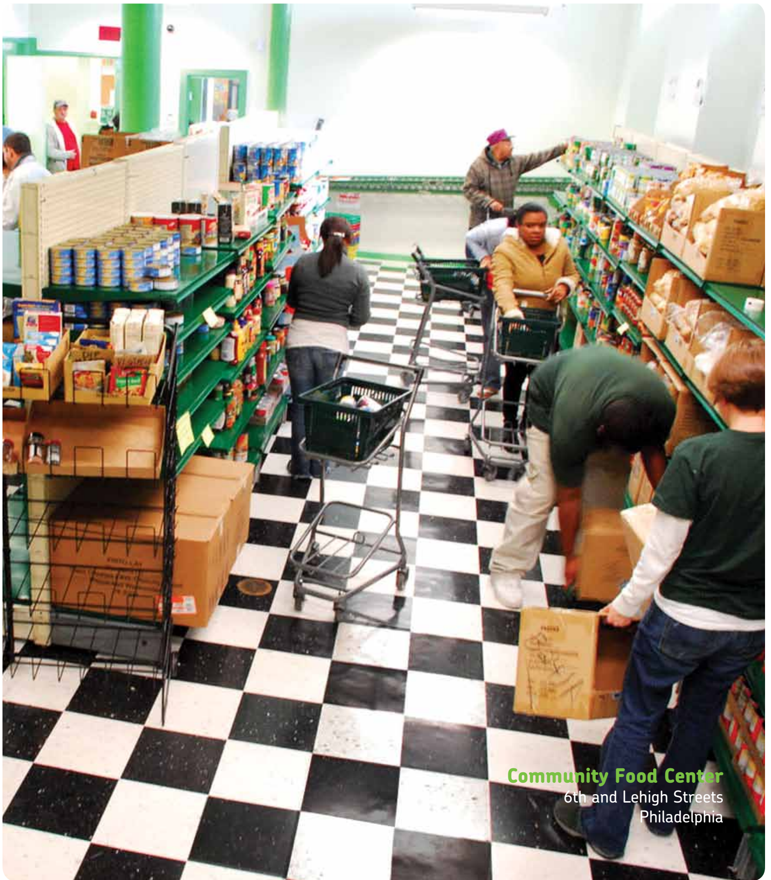
Community Food Center 6th and Lehigh Streets Philadelphia