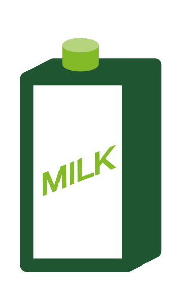
BOXED, NON-REFRIGERATED MILK