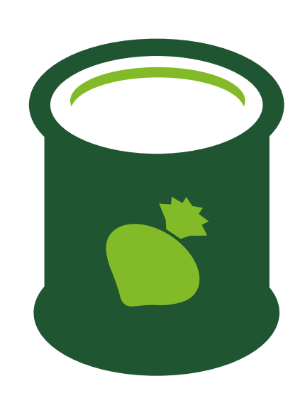
CANNED FRUITS & VEGETABLES