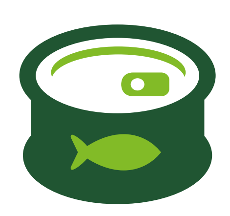
CANNED TUNA OR MEAT